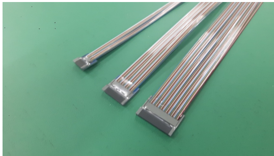
127 \mu m Pitch Fiber Arrays (48CH, 96CH, 136CH)